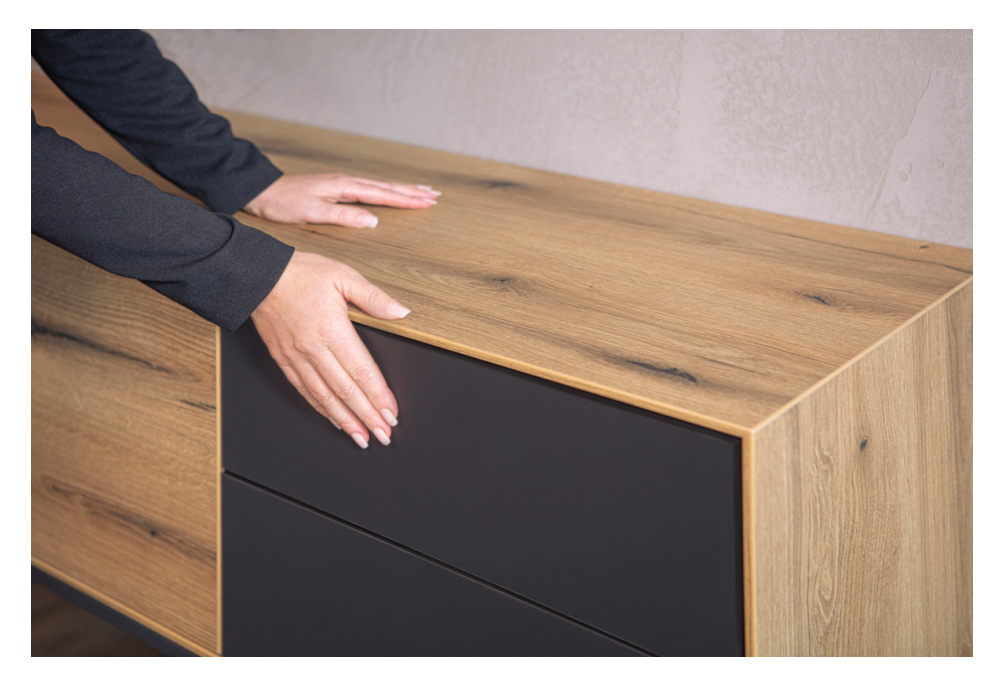
Caption: Dekor 2190 OM, Schwarz, Optimatt Anti-fingerprint