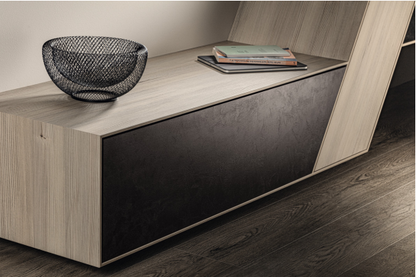
Caption:BOARDS LEAD22 Decors K2406 Al Abies Shine und 42238 DP Beton Art Infinity