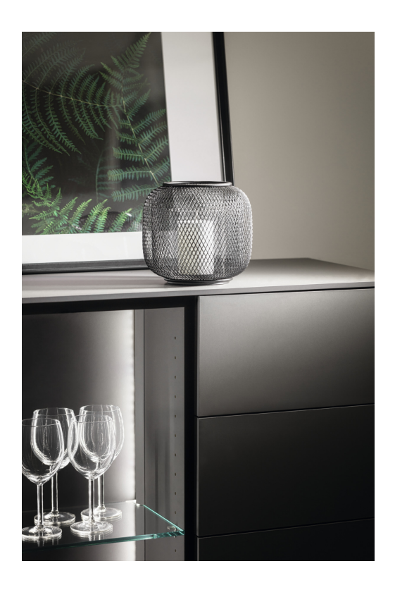
Caption: Decor 2166 OM, Basalt, Optimatt Anti-fingerprint